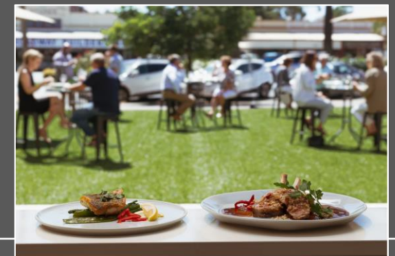
Pop-up Restaurant & Bar