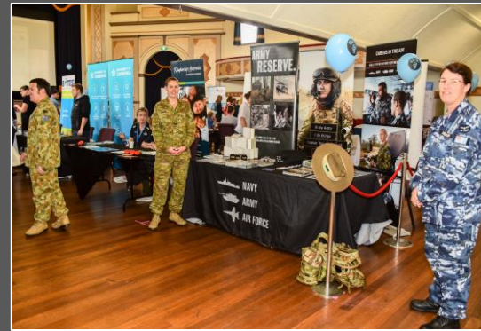
Corporate Functions / Trade Shows